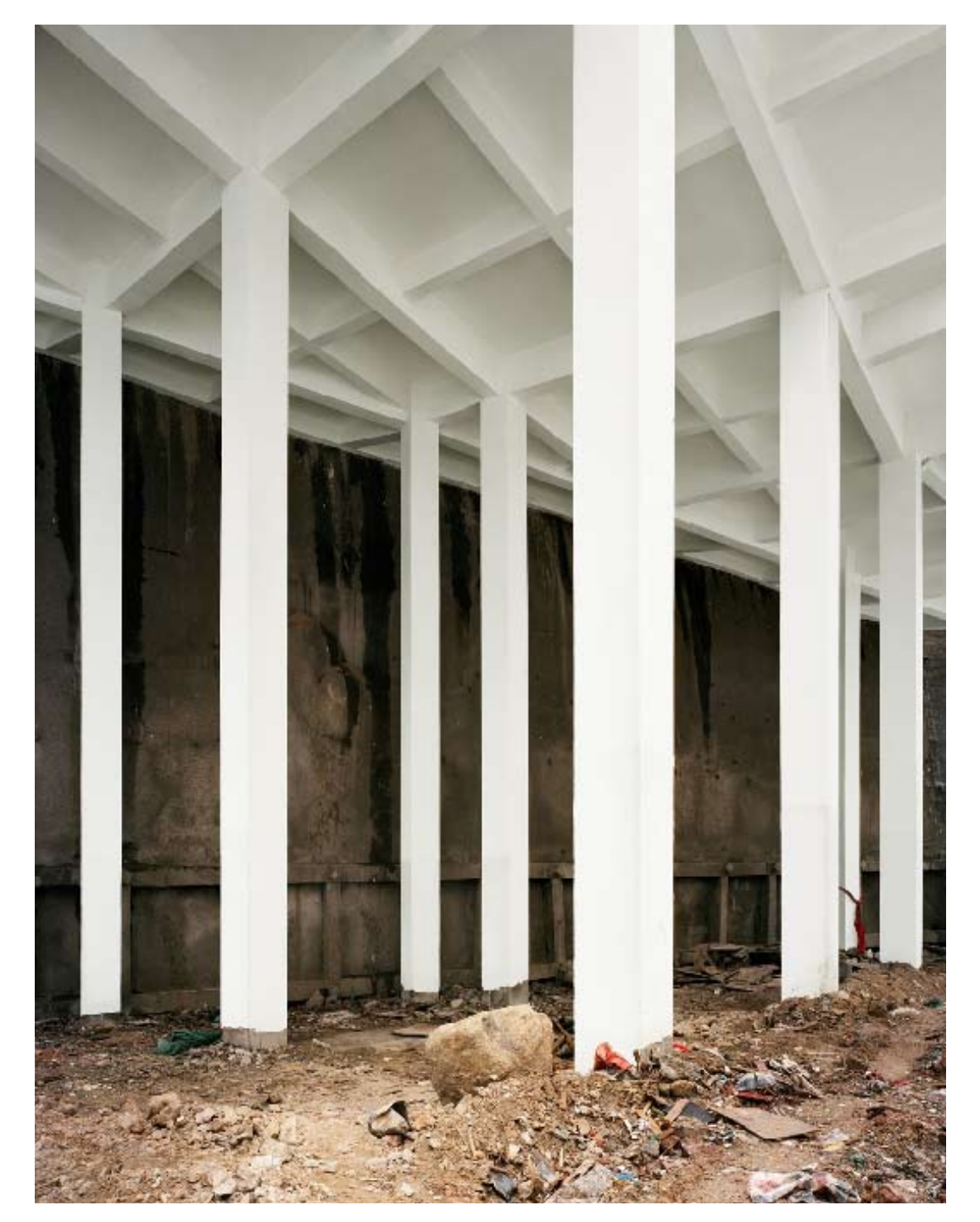
Grid II 2008

It looks as though in the midst of a harsh, but natural scene, some manmade construction — a sluice of some sort — has broken through, destroying what is around it and itself at the same time (it looks broken or incomplete), and in the process of collapsing or spilling, loses its sense and merges into its surroundings, almost becoming natural itself. I can't tell what I am looking at: nature or man-made environment; construction or destruction; nature, artifice or something else; something being made, something falling apart or something in between.