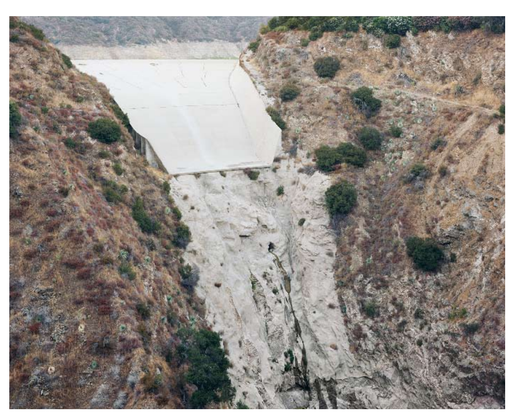
Reservoir (concrete rundown) 2005

I began to photograph these 'landscapes' in a way that the landscape and the people who are staying in it are becoming one; that they are of equal importance. In this way, it becomes impossible to decide which is more important, the humans or the landscape. I photographed them as if these places were made specifically for them.