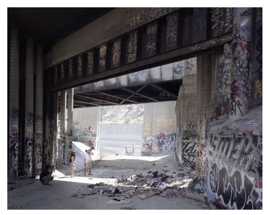
River Overpass 2005

BP: I saw this building from the air. I made a small trip in Russia in a Cessna-like plane to make an aerial photograph of the city of Ivanovo for the exhibition 'Shrinking Cities' and on the way, I saw this huge, red, unfinished post-modern ruin in the middle of nowhere. Later I went there with my guide and translator and it turned out to be a kind of cultural monastery for communist artists: construction had stopped just before completion when the Iron Curtain fell. It filled me with a strange feeling, like being in the past and the future at the same time, like walking into a scene of a Tarkovsky film. In some way the photograph is extremely banal, but it is the absence of certain key elements that makes it impossible to tell if it is a construction site or a ruin. It resembles many things at once, from stone quarries to underground shelters, old drawings and scenes from sci-fi movies.