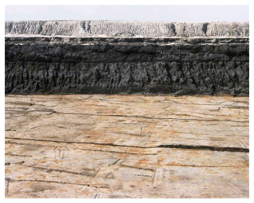
HSL Breda 2002

BP: This is an important image for me, since it has all these different ways of being interpreted, and yet the image is nearly invisible and can be easily overlooked. I passed this site nearly every day by car driving down Wilshire Boulevard on the way to downtown LA, and it looked different every time I passed it. I tried to photograph it several times from different angles and it did not really work, but I kept on thinking there was something there, even though I could not figure it out what it was. At one point while setting up the camera, I cropped off the top of the building and suddenly the building disappeared, and at that moment I understood how I had to