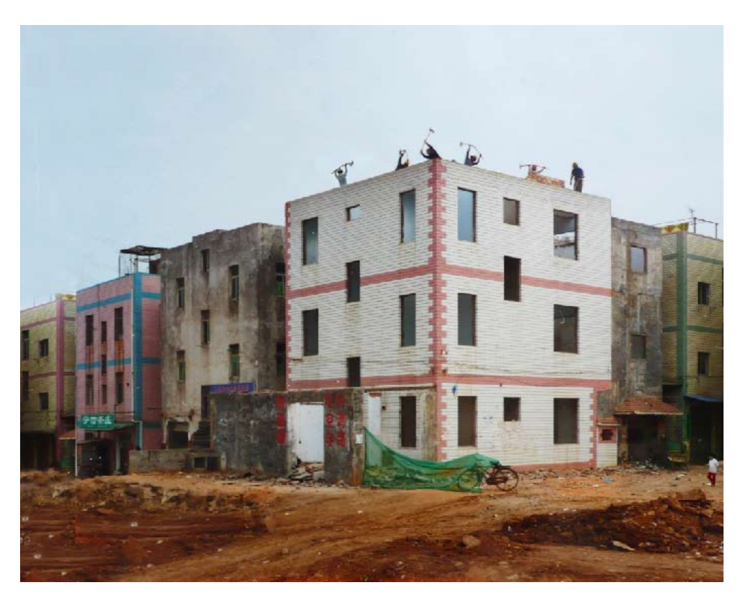
Future Highway (Xiamen)

wall, next to other works, on the web, or in magazines. To see the works at their 'real size' (often large prints) is always impressive: your eye can wander around in the print, and that is usually what happens. In a book, however, this experience is absent, but you get something more interesting in return; you start to see the works more as images that try to tell you something. I mean this in a more abstract sense: you can see the ideas behind the picture more easily, at least in my case. I like that there is this kind of difference. A big picture on the wall can be easily seen as a 'window' to some distant reality, and has therefore a more documentary character, while in a book you have that much less, and so will refer each image to the one you saw before. The wall is about the single image and the book is about the series. For a book, you need many more works, and they need to tell you something in their relations to each other, and I like to work with this.