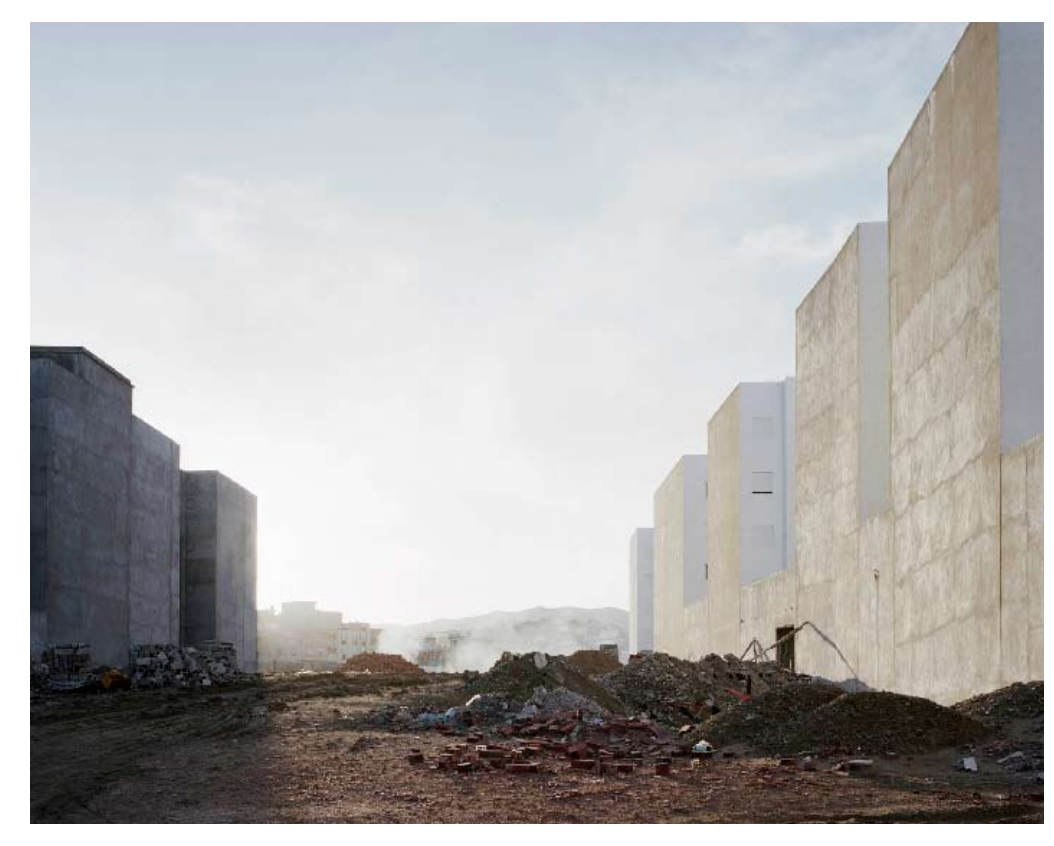
Ring Road (Findeq / Ceuta) 2007

MP: River Overpass 2005: This space, left by disused infrastructure looks so monumental, and so benign, despite all the dangerous things one might associate such places with. It is as though it has become a ruin in that worldwide itinerary of monuments of the ancient world, like the Acropolis or Borobudur, and the subject of tourism. Looking at the tourists (or photographers) in the picture, I am reminded again of Piranesi, and the scenes in his Vedute di Roma, where the monuments of the past are collapsed, consumed by nature, and rambled over by the finely dressed young gentlemen and ladies of