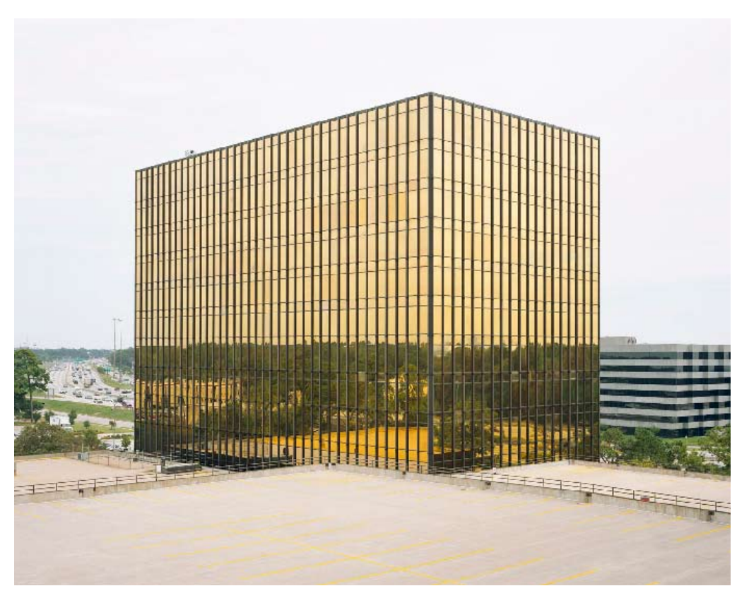
Ring Road (Houston) 2005

fragment of a monument or the most banal dwelling. It seems to be a precisely defined space, yet it seems that it could extend indefinitely, both in height and in depth. I am struck by its resemblance to the Carceri series of engravings by Giambattista Piranesi, but unlike their fantastic and claustrophobic artificiality, I am aware of a mythic dimension to your picture, an aura of authenticity, and even the sacred, that comes with its materiality, colour and evocations of the ancient world.