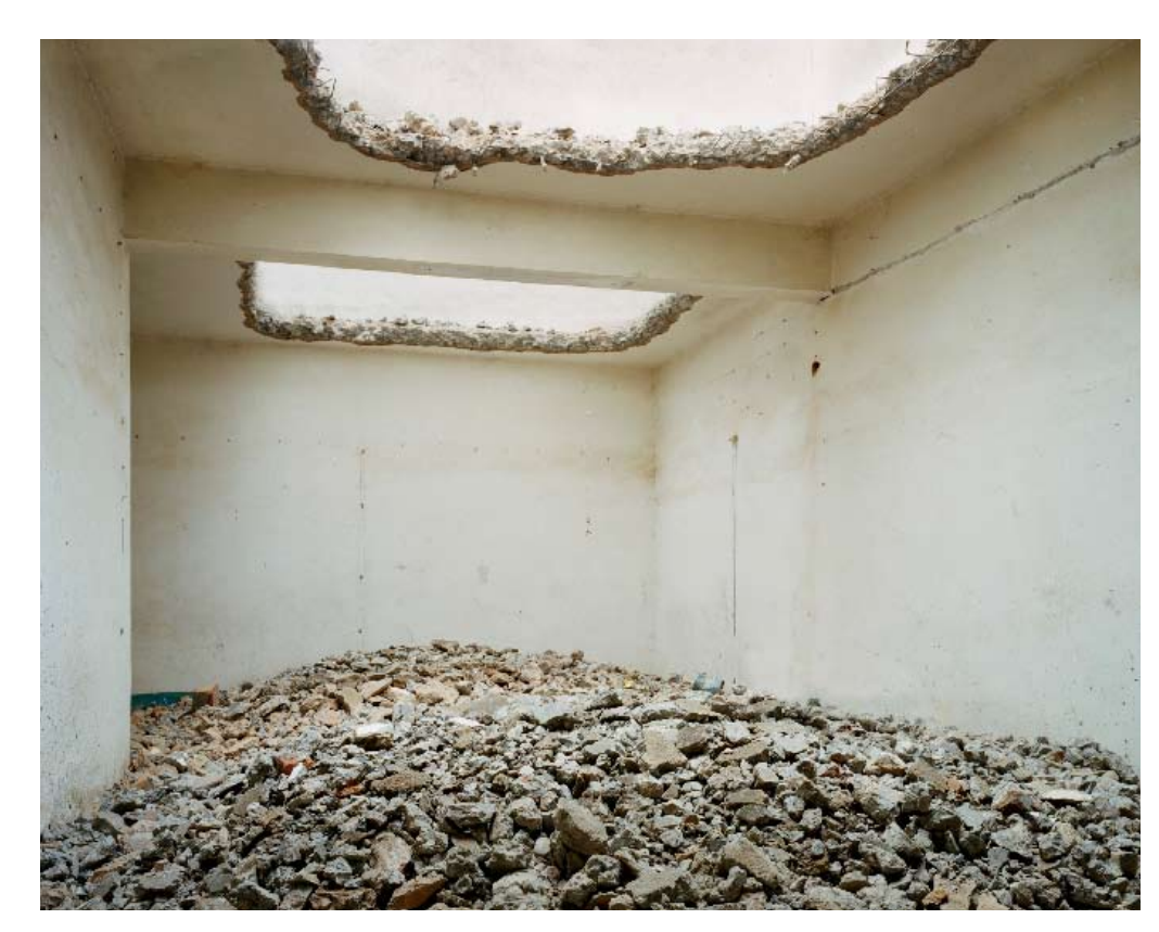
Domino II 2007

MP: There is something else about the hammerers, too, isn't there? In a previous conversation, you also mentioned the appearance of labour. So often in the way the world is presented to us, it is as a perfect thing. Not only are the processed of construction or demolition invisible, so are the millions of people actually engaged in making it happen. Instead of some invisible force making the world, which we, I suppose, are to assume is Capital, there are real people, making the environment, and living in it. Yet so often what appears before the viewers of your pictures is a contrasting quality of artificiality, and the confusion raised by the artificial. There is