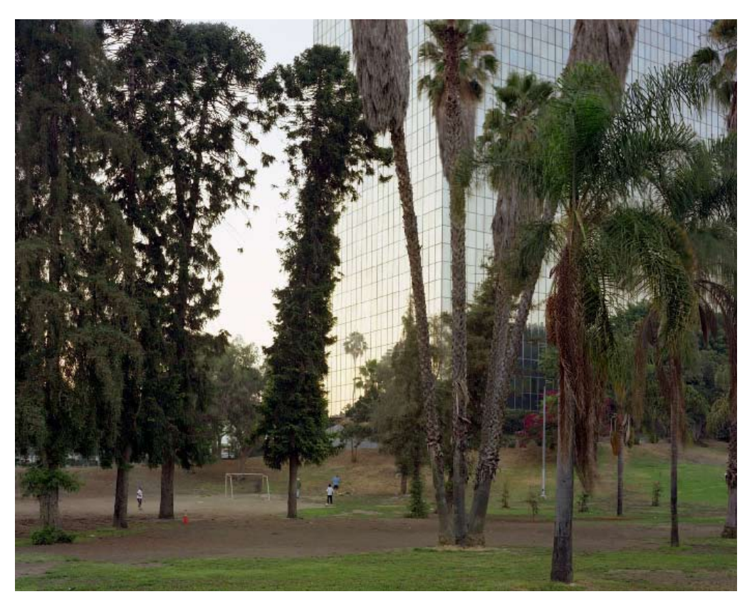
Superior Court 2005

A series, like the one I am working on now (shown with this article), with the working title Utopian Debris , starts as a small set of loose individual pictures, which I have collected over time and which may seem to have nothing to do with each other at first glance. (for instance Reservoir , Palech , Superior Court and HSL Breda are part of this first set). From there, I start to imagine what kind of images, objects and landscapes could or should make a link between two of these existing pictures, either aesthetically or thematically. I try to make every new photo converge with two or more photos that already exist. After a while, a series starts to appear in which one